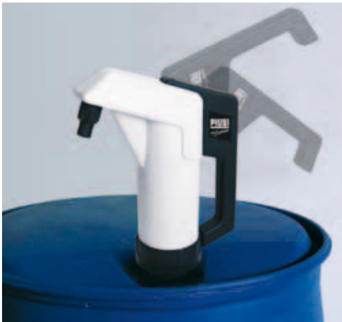
Cod. F00332090 Piston hand pump (with dip pipe)