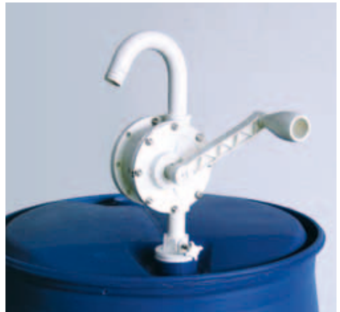
Cod. F0033205A Rotative hand pump (with dip pipe)