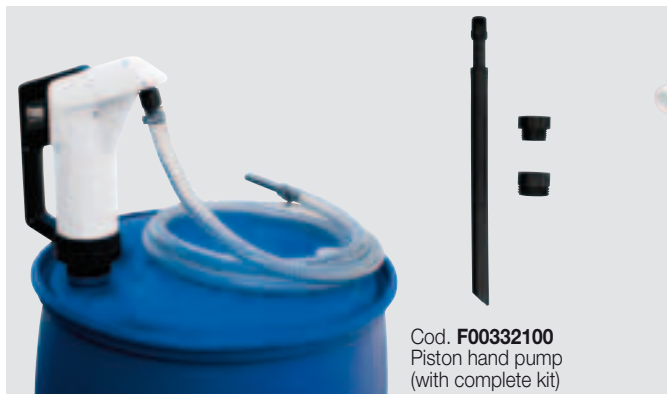
Cod. F00332100 Piston hand pump (with complete kit)