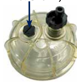
Port Plug (WIF Probe Not Shown)