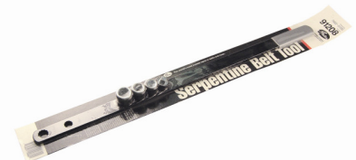
TENSION RELIEF TOOL