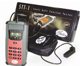
SONIC TENSION TESTER