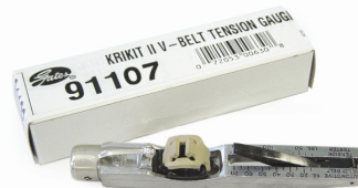
KRIKIT TENSION TOOL