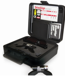
LASER ALIGNMENT TOOL