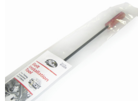
BELT INSTALL TOOL